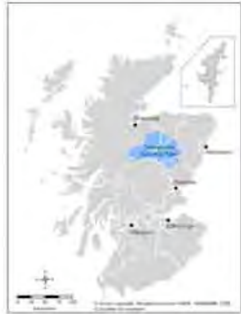
Map 1 The location of the Cairngorms National Park

the context for development planning and management in the Cairngorms National Park, with general guidance and specific direction for the Local Plan.